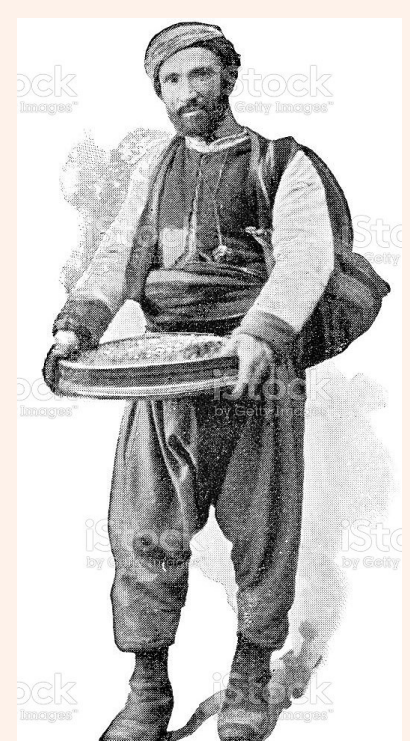
Istanbul street vendor

"Soundscapes of Detention in Cold-War Greece: From Sonic Enclosure to Acoustic Witnessing"